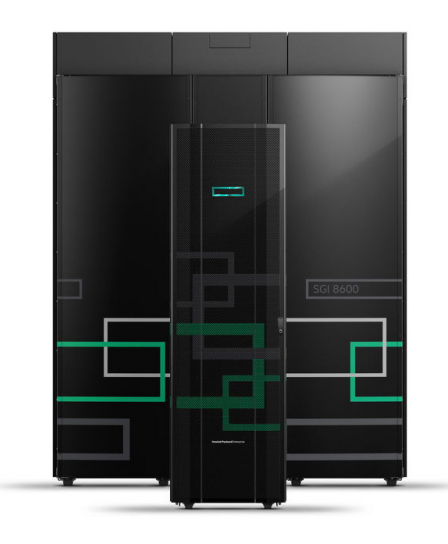
FIGURE 6-5: The HPE SGI 8600.

For petaflop-scale deep learning, HPE introduced the HPE SGI 8600 (see Figure 6-5). This liquid-cooled platform delivers leading performance, density, and efficiency and is used for extremely large training exercises. There are three compute trays, with the HPE XA780i Gen10 Server as the ideal deep learning platform used to monitor and observe data processing for pattern recognition and anomaly detection. This tray features a two-central processing unit (CPU) socket node with the Intel Xeon Scalable processors with support for up to four NVIDIA Tesla graphics processing units (GPUs) with NVLink.