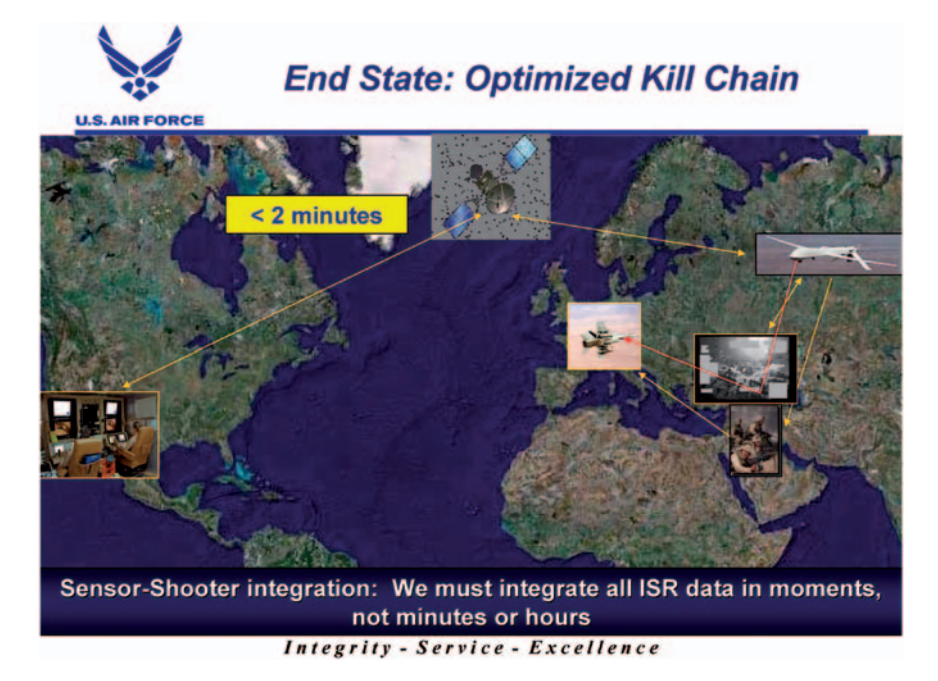
Figure 5 'Optimized kill-chain'

'scurrying over those they hit too fast to witness the devastation they cause and the blood they spill', he insists that all of those watching a UAV mission in real time 'see the target up close, [they] see what happens to it during the explosion and the aftermath. You're further away physically but you see more.' In fact a constant refrain of those working from Nevada is that they are not further away at all but only 'eighteen inches from the battlefield': the distance between the eye and the screen. This sensation is partly the product of the deliberate inculcation of a 'warrior culture' among UAV pilots, but it is also partly a product of interpellation, of being drawn into and captured by the visual field itself.<sup>15</sup>