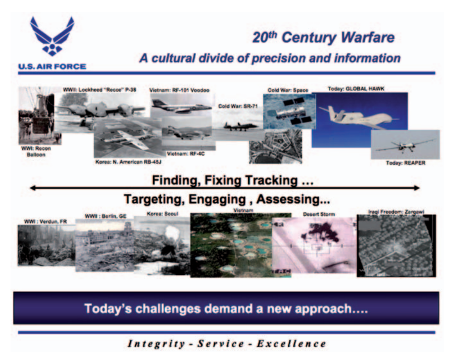
Figure 6 'A cultural divide of precision and information'

late modern war. Indeed, Gros (2010: 268) doubts that it is proper to call it war at all: