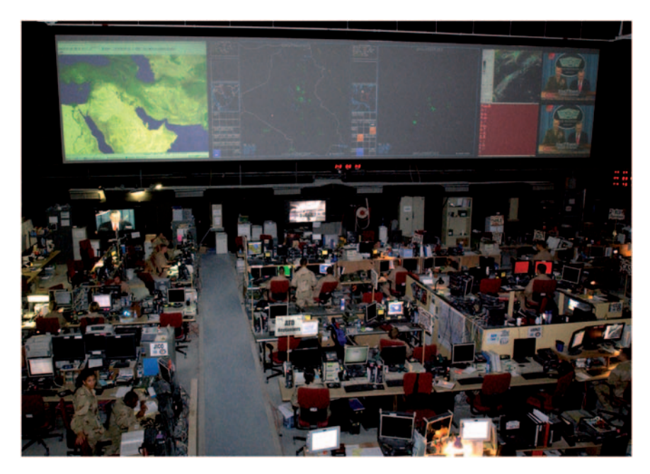
Figure 4 Combined Air Operations Center

intelligence). When the staff at the CAOC are added to the list, a remarkable number of people are able to be in direct or indirect contact by voice, video or internet relay chat (mIRC) as each mission progresses.