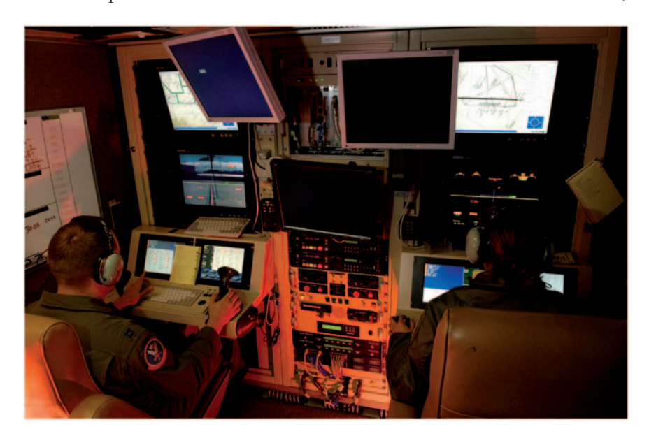
Figure 2 Ground Control Station, Creech AFB, Nevada

As the Predators and Reapers flown by the USAF have become more closely integrated into counterinsurgency, however, this picture has become more complicated. In what follows I focus on their hunter-killer role,